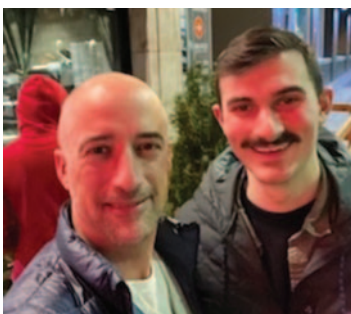
After returning home to Seattle, I ran into an '87 progeny. Any guesses?

After returning home to Seattle, I caught dinner with an '87 progeny. Any guesses?